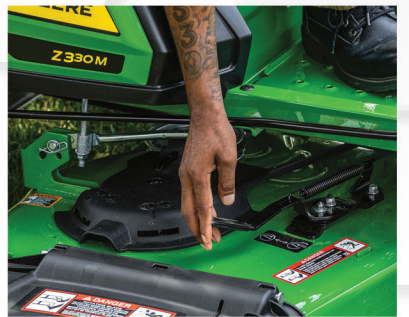
Mulch capable decks for clipping options regardless of your mowing conditions.