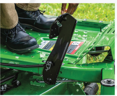
Easily raise and lower your deck with a foot deck lift pedal.