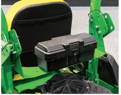
Extra on-board storage for tools or personal protective equipment.

Ask about our Extended Warranty Protection Plans , starting at just $269!