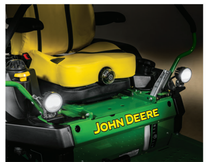
Light kits let you mow when it fits into your schedule.