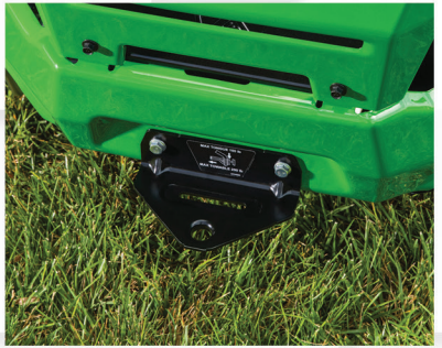
Tow hitches come standard (Z300), with towing capacities up to 250 lbs.