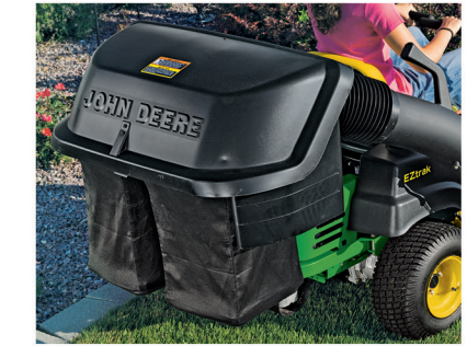
Large capacity material collection systems work great on grass and leaves.

Residential Zero-Turn Mowers / Z300 & Z500 Series