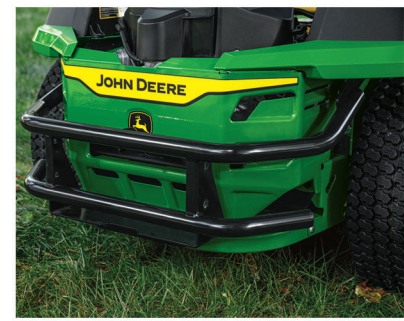
Rear bumper protection for when accidents happen.