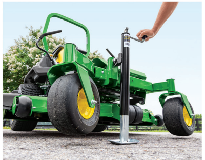
For those who enjoy DIY maintenance, jack kits help make it fast & safe.